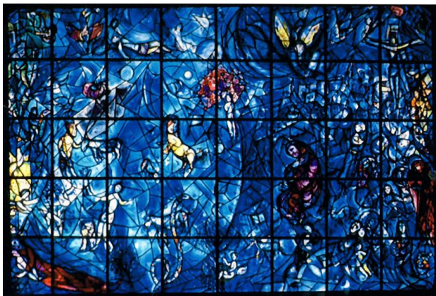
Marc Chagall, 'Peace Window', United Nations Building, New York, 1964

When glory leads the way, you'll be madly rushing on, Never thinking if they kill you that my happiness is gone. If you win the day perhaps, a general you'll be: Though I'm proud to think of that, what will become of me! Oh, if I were Queen of France—or, still better, Pope of Rome, I would have no fighting men abroad—no weeping maids at home. All the world should be at peace, or if kings must show their might, Why, let them who make the quarrel be the only men to fight. (Jeannette's Song', c. 1848) 31