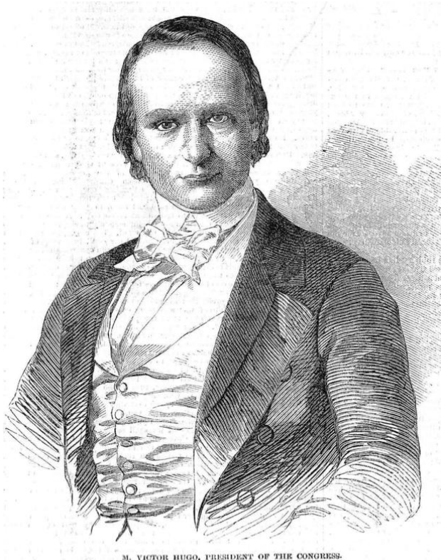
M. VICTOR HUGO, PRESIDENT OF THE CONGRESS.

Let us give the word to those great voices [of the Enlightenment]. Let us stop the shedding of human blood. Enough, enough, you despots! If barbarism persists then philosophy must protest. If the sword is relentless, then civilisation must denounce it. Let the 18th century come to the aid of the 19th century! The philosophers who came before us are the apostles of truth, let us invoke the illustrious shadows of those who, faced by monarchs who dreamt of war, proclaimed the human right to life, the right of conscience and freedom, the supremacy of reason, the sanctity of work, and the blessings of peace. And, since the thrones of our monarchs cast us into darkness, let the tombs of these great thinkers restore us to the light!