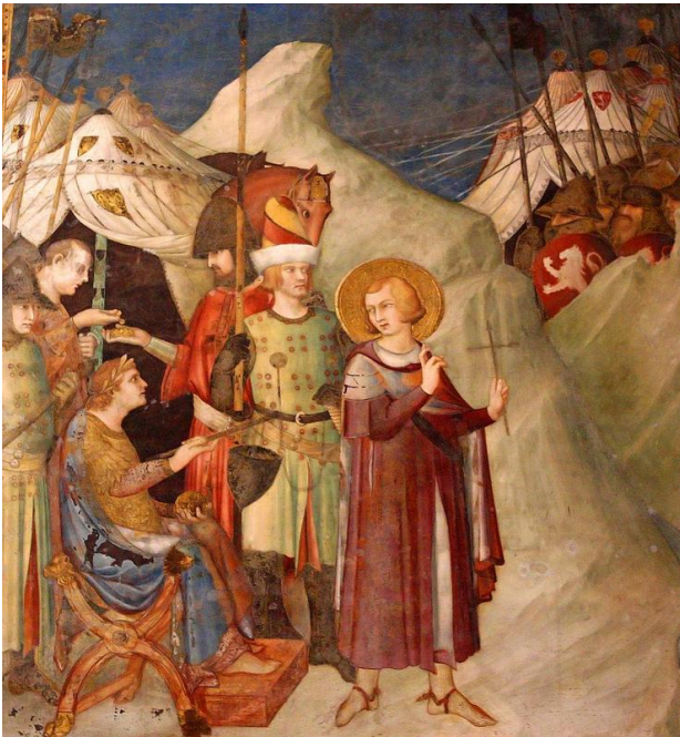
Simone Martini, St Martin Renounces his Weapons' c. 1320, Basilica di San Francesco, Assisi

numerous wars. In his great work The City of God , Augustine was far more eloquent on the subject of peace. 'In the city of man as well as in Heaven,' he wrote, 'there is a desire for peace which may be achieved on earth to some degree. Even the warrior who had to take up arms,' said Augustine, should regard 'the prevention of shedding blood as his real mission'. Man's nature moves him powerfully 'to maintain peace with all other men as far as he is able', and anyone who can contemplate warfare without heartfelt grief has 'lost all human feeling'.