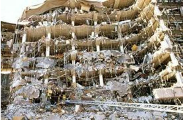
On April 19, 1995, the Alfred P. Murrah Federal Building was bombed, killing 168 and injuring 800.

comparison, executions in America are much more transparent, 17 and the execution of Timothy McVeigh opens an especially wide window onto the sensibilities of victims and survivors because his lethal injection was the most widely viewed execution in America in half a century, 18 and because Madeira