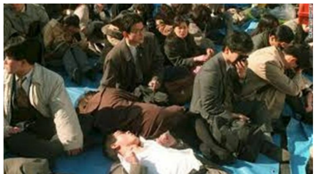
The scene outside a Tokyo subway after the sarin gas attack of March 20, 1995, which killed 13 and injured 6300.

Three commissions were created to investigate what went wrong in the Fukushima nuclear disaster of 2011, and the US federal government created a commission to prepare “a full and complete account of the circumstances surrounding the terrorist attacks of September 11, 2001,” 4 but no commission has ever been established to examine these and other AUM-related puzzles. 5 The result of this failure to look and learn is a level of ignorance that could prove catastrophic when terrorists target Tokyo again.