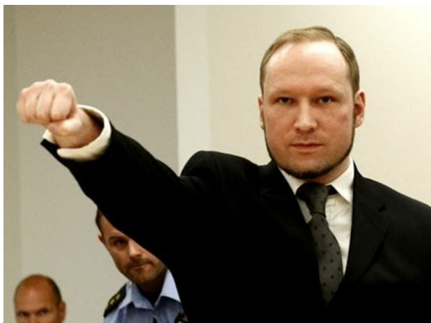
Breivik in Oslo courtroom after sentencing.