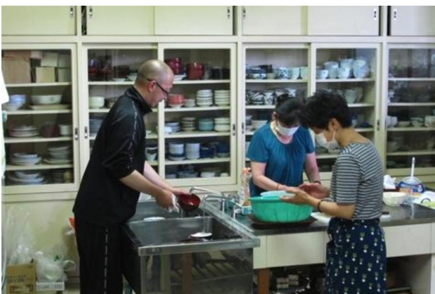
... but today the young monk has overslept and only arrived at breakfast at 6.30 a.m. The women decided that he must be educated by having him doing all the dishes alone.