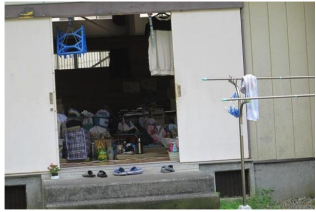
The sports hall of Minami Elementary seen from the back entrance.