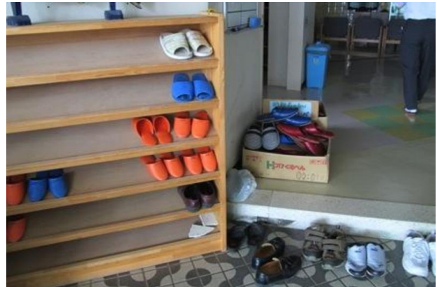
Shoes and slippers outside a prefectural youth house in the south of Yamada that functions as both a school and a hinnanjo .