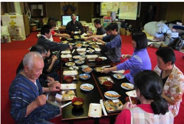
Dinner at the hinanjo of Ryūshōji. Some people are still at work. Dinner at all hinanjo was usually a bento box and miso soup. At the temple, the women usually prepared a few extras. The women were excellent cooks.

district of Yamada that had not been damaged by tsunami, invited everyone staying in Yamada's shelters to bathe there for free. As soon as they had electricity to heat up the water, the Shimadas provided a bus and shuttled groups of bathers in turn.