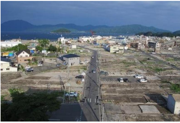
Yamada in July 2011