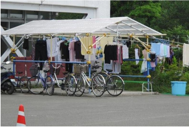
Laundry in front of the hinanjo at a prefectural youth house ( seishōnen no ie ) in the south of Yamada.