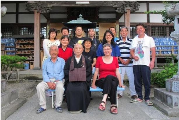
The author and some of her project collaborators at Ryūshōji.