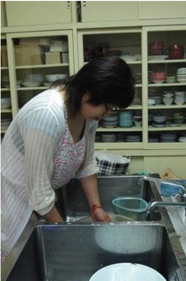
Cleaning the kitchen and dish-washing is women's work.

well-trained in hygiene practices even before the disaster.