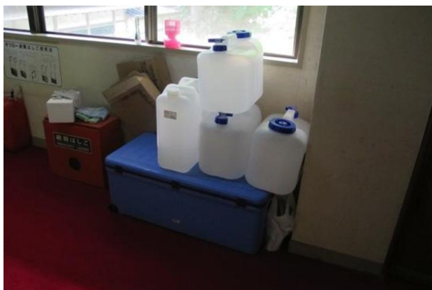
Water canisters at Ryūshōji. No longer in use, but always in reach.