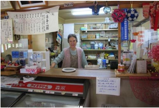
The owner of Shimada kosen at the counter of her bath house.