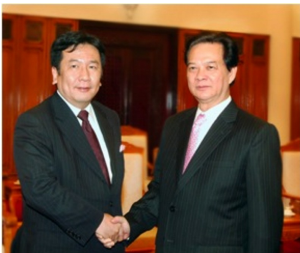
Prime Minister Nguyen Tan Dung (right) and Japanese Minister of Economy, Trade and Industry Edano Yukio in Hanoi.

"Drawing on lessons from the Fukushima nuclear accident, we want to help (Vietnam) build nuclear power plants with the highest level of safety". "Bearing in mind lessons from the accident at the Fukushima No. 1 plant, we'd like to promote this collaborative effort by sharing our experiences with your country," continued Edano . [See also Kimura Sato, Japanese Nuclear Power Generation Comes to a Vietnamese Village http://japanfocus.org/-Kimura-Satoru/3824 With this alchemy, Japan's nuclear disaster is turned into an asset to assure the Vietnamese purchaser of Japan's technical expertise.