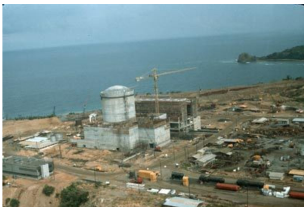
Bataan Nuclear Power Plant