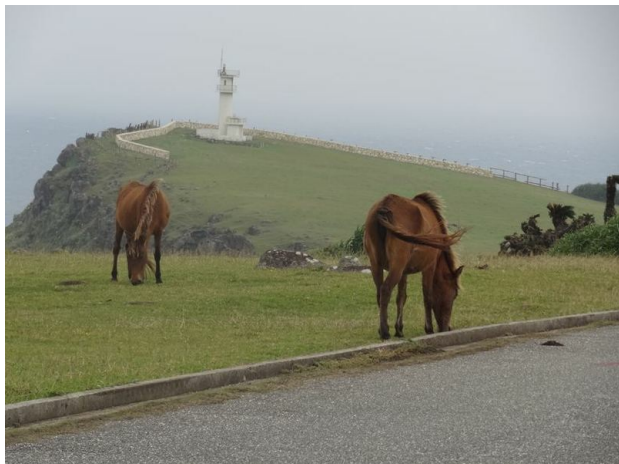
Yonaguni, Site for a Base? (November 2011)

Yonaguni people looked back at the integral links that used to exist between Yonaguni and Taiwan both during the colonial era, when the short crossing was a common path for education, trade, or employment, and during the interlude that followed the collapse of the empire when, in the absence of any central government authority, Yonaguni briefly flourished as an entrepot trading port, albeit technically its ports were illegal and the trade was "black."