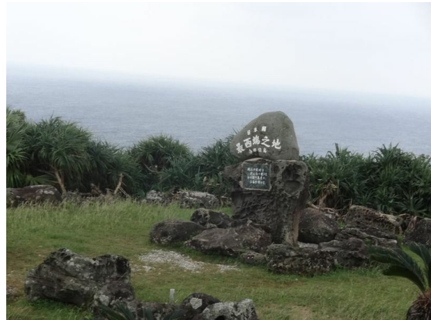
Cape Irizaki, Yonaguni, Westernmost Point in Japan

These islands were long part of the Ryukyu kingdom, but, so marginal did they once seem to Tokyo that, though only incorporated in the modern state in 1879, Japan offered them to China a year later as part of a deal: the Yaeyama Islands to China in return for “most favoured” nation access for Japan to the interior of China. In other words, Meiji Japan saw them as peripheral and would gladly have sacrificed them for recognition as a major imperialist power claiming rights in China. China, however, proposed instead a three-way division – North to Japan, South (including Yonaguni) to China, with a revived Ryukyu kingdom on the Okinawan main island. As the two sides haggled over how to split the islands to