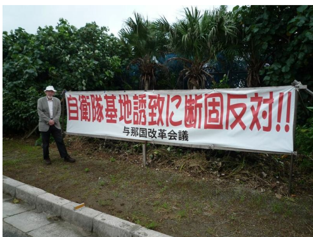
Anti-base poster, Yonaguni, November 2011

East Asia's territorial issues, notably centred now on the Senkaku/Diaoyu Islands, will either be solved, as part of a comprehensive settlement and the construction of a regional order of peace and cooperation in the interests of the surrounding states and peoples, or they will fester and feed heightened confrontation and militarization. It is hard to see evidence of the former at present. As for the latter, it will mean places like Yonaguni becoming more vulnerable and divided.