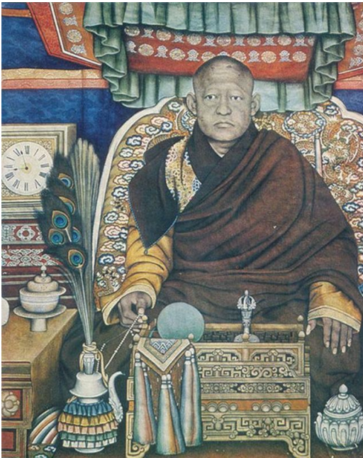
The last Bogd Khaan

consultations, we have now decided to establish a new state [törü], based on our old tradition, without the interference of others in our own rights. Our Mongolia should not be ruled by Manchu-Chinese officials. After taking away their rights and powers, an ultimatum for their extradition to their original homeland has finally put an end to their power, although by sending them back we do not intend that ordinary honest Chinese traders should suffer. 25