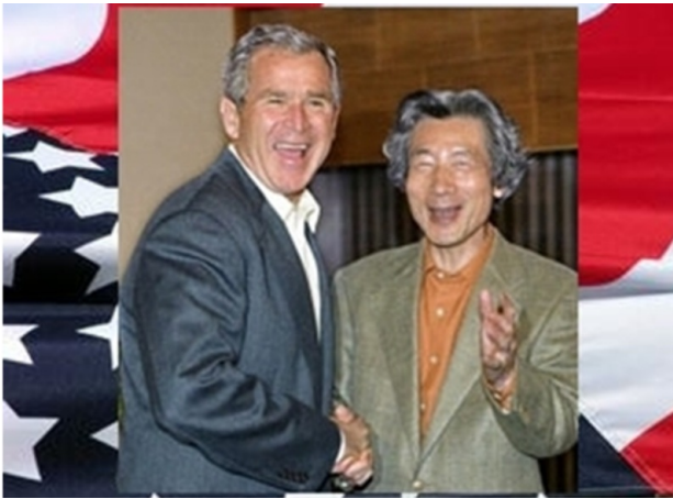
President George W. Bush and Prime Minister Koizumi Junichiro, July 2006

In the post-Cold War period, the Hosokawa Morihiro government made a brief attempt in 1993-4 to articulate an autonomous line. A report prepared at its request by Higuchi Kotaro of Asahi Beer noted the slow decline of US hegemonic power and recommended Japan adopt a more autonomous, multilateral, and UN-centred diplomacy. But it was quickly overwhelmed and abandoned following the return of LDP-led government and the US riposte in the form of the Joseph Nye report of 1995 that insisted that East Asian security depended on the “oxygen” of US military presence and the base system had to be preserved and reinforced. 12