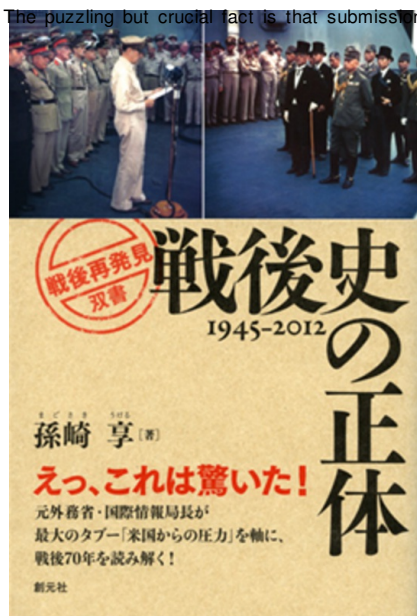
Magosaki's The Truth of Postwar [Japanese] History , Sogensha, 2012

is not forced but chosen. The client state is happy to have its "patron" occupy parts of its territory, and determined at all costs to avoid giving it offence. It pays meticulous attention to adopting and pursuing policies that will satisfy its patron, and readily pays whatever price necessary to be sure that the patron not abandon it. Having some of the qualities of a feudal relationship in the sense of fealty for protection, it may therefore also be described as "neo-feudal." As one scholar puts it, "servitude" is no longer just a necessary means but is happily embraced and borne. 'Spontaneous freedom' becomes indistinguishable from 'spontaneous servitude'. 7