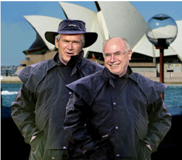
Australian Prime Minister John Howard with President George W. Bush. ( The Courier Mail , 31 January 2009)

"Our sense of independence has flagged, and as it flagged we have rolled back into an easy accommodation with the foreign policy objectives of the United States ... More latterly, our respect for the foreign policy objectives of the United States has superimposed itself on what should otherwise be the foreign policy objectives of Australia." 38