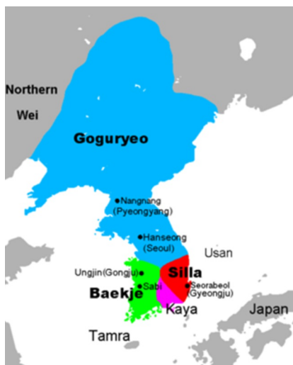
China and Korean peninsula in 6 th century

In meta-historical terms, Japan has preserved a wary distance from China for well over a millennium, ever since the “Battle of Baekgang” (or Haksukinoe) in the year 663, when the combined forces of Tang-Silla (states then dominating China and the Korean peninsula) defeated the combined forces of Baekje and Yamato (rival states on the Korean peninsula and the Japanese islands). 3