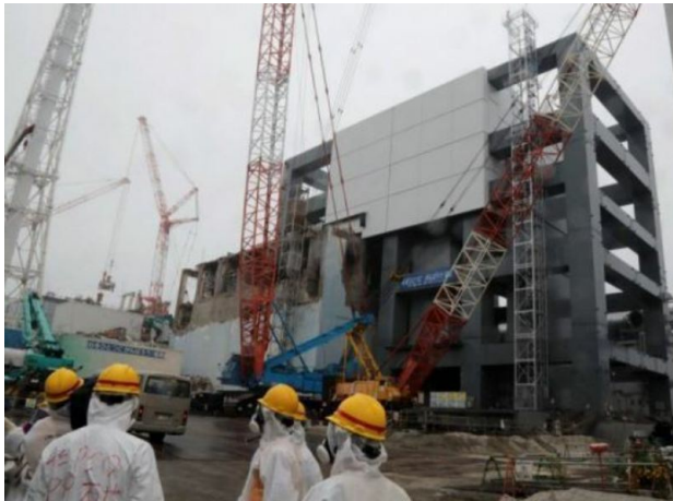
Reporters and Tokyo Electric Power Co workers during a tour of the Fukushima nuclear plant on June 12, 2013

Japan's ruined and radioactive reactor plant at Fukushima Daiichi has been an abiding source of concern among knowledgeable observers. There are a host of good reasons for this reemergence. As this Mainichi survey observes , it is now clear that several hundred tons of radiation-contaminated water is entering the ocean per day. Over the past week, it suddenly returned as an intense focus of concern in the Japanese 1 and quality overseas press. 2 There are a host of good reasons for this reemergence. As this useful summary of articles and expert statements reveals, it is now clear that several hundred tons of radiation-contaminated water is entering the ocean.