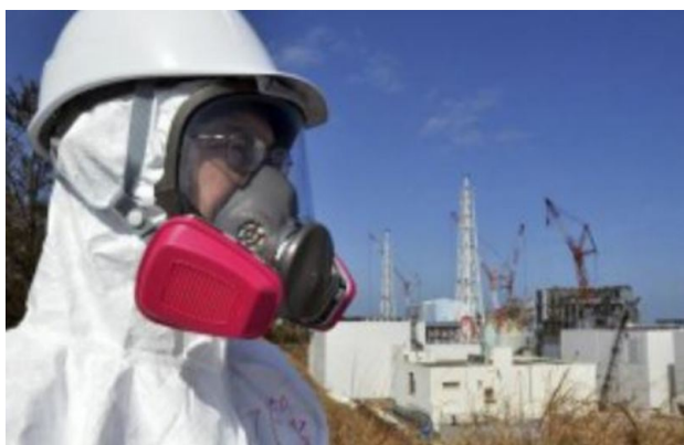
Japan’s nuclear reactors are predicted to restart by July 2014

The public finances have already been deployed in a number of initiatives, including the injection of YEN 1 trillion into Tepco on July 25 of last year. 10 They will apparently be used again to freeze the ground around the site. In all likelihood, public money will have to be used to cope with soon-to-be insufficient and corroding tank storage. And that is just on-site. Look beyond the plant itself, and there is the huge burden of clean-up and compensation in the region. Further beyond that, there is the prospect that the nuclear-holding utilities are going to find themselves with very stranded and toxic assets, due to the increasingly fraught political economy of restarts. 11