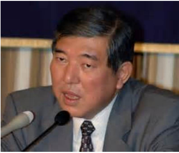
Ishiba Shigeru, LDP Secretary General, wants to keep the nuclear bomb option open

be made. (Tokyo Shimbun 9/22/2012) At a METI sponsored conference last autumn, an American speaker stressed that any such decision would have a very adverse impact on US relations. It would mean that Japan has no reactors to use the plutonium fuel and thus the US might have to retract permission to reprocess spent nuclear fuel sourced in the US. There are regional implications as well; South Korea lobbied vigorously this year for permission to enrich uranium and reprocess nuclear fuel in order to lower costs and better position its industry for reactor exports. Washington postponed deciding on Seoul's request.