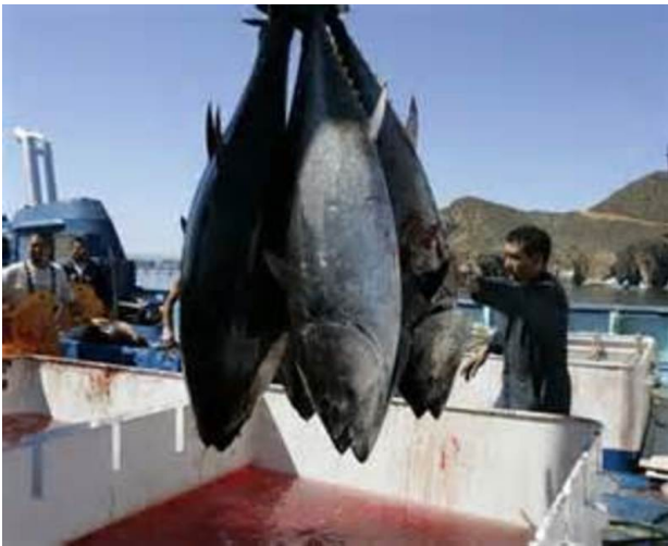
Fukushima's fishermen wonder if they will ever be able to resume their livelihood

The government acknowledges that radioactive water has been leaking continuously since the 3.11 accident (in the aftermath of this cataclysm Tepco released tens of thousands of tons of heavily contaminated, untreated water into the ocean from the Fukushima site), although the level of contamination and cumulative volume of leaks cannot be confirmed. (Reuters 8/7/2013; DeWit 2013b) In January 2013 the media reported that fish caught off the coast of Fukushima had extremely high levels of radiation and since then there have been numerous reports about Tepco's bungled water management and failure to anticipate problems such as large volumes of groundwater flowing through the plant site that becomes contaminated as it mixes with water used for cooling. (NYT 4/29/2013) In June, the NRA voiced suspicions about plant leakages causing high radioactive readings in the adjacent ocean, but didn't act. (Asahi 6/26/2013) Subsequently, in July, the NRA stated that Tepco had no option other than releasing the tainted water into the ocean although calling on it to use purification systems to filter out radioactive substances. (Asahi 7/25/2013) Local fishery associations oppose the releases and remain skeptical about assurances that the processed wastewater is safe. They also worry about how these revelations about contaminated groundwater pouring into the ocean will sabotage their efforts to regain consumer trust.