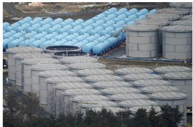
Fukushima Daiichi site now covered with tanks for storing radioactive water

Tepco has adopted various strategies to store the flood of highly contaminated water and none have worked, and has only belatedly acknowledged that it is overwhelmed by the problem. (Asahi 8/3/2013; 7/23/2013) Contamination remains high because cracks in the reactor buildings and basements remain unrepaired. These areas are dangerous to access because radiation levels remain very high.