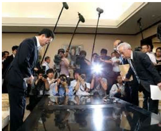
Tepco president Hirose Naomi (rt) turned down by Governor of Niigata

Based on the new safety guidelines enacted in July 2013, four utilities have applied to restart ten reactors. All are pressurized-water type reactors, unlike the Fukushima boiling-water type. They have a five-year grace period to install the filtered venting system while the latter type must have the filtered venting system installed at the time of the restart application. The decision about approving restarts of these reactors located in Hokkaido, Fukui, Ehime, Saga and Kagoshima prefectures may be finalized by year’s end. Tepco’s bid to restart its massive plant in Niigata Prefecture, however, looks far less likely because the governor is opposed and the clean-up and decommissioning at Fukushima has been a public relations nightmare for the utility and a black-eye for nuclear power in general. The Asahi fumed, “we have zero faith in the utility’s reliability as an operator of any nuclear power plant.” (Asahi 7/31/2013)