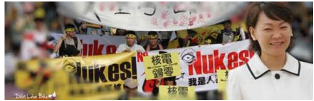
Akie Abe Supports Anti-Nuclear Movement

demand. But, business lobby groups complain that this has necessitated price hikes, inflicted operating losses on the utilities and threatens the power companies ability to service their massive nuclear plant related debts.