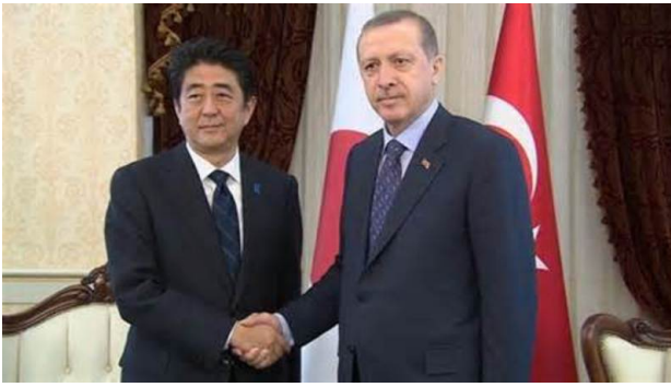
PM Abe Clinches $22 bn Nuclear Deal with Turkish PM Erdogan