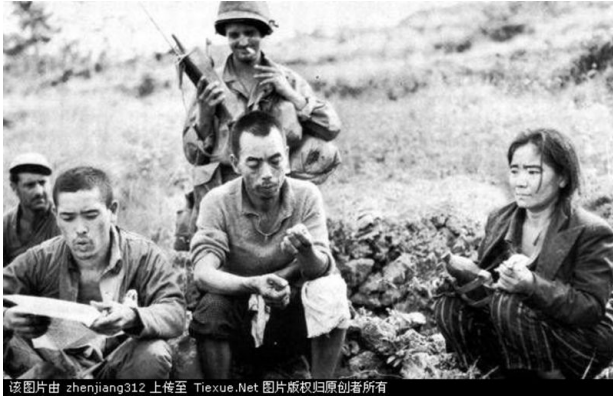
Civilian P.O.W.'s, Battle of Okinawa

Now it was too dangerous to stay in the tomb any longer and, with no more food, we decided to leave for northern Okinawa. On the way, my grandmother and I got separated from the others, and ran into some American soldiers. Luckily, they didn't stop us, and we were able to meet up with our group again later, as we all headed north. What I remember most after that is stepping over dead bodies and drinking water full of mosquito larvae. I tried not to look at the bodies, but they lay everywhere, swelling up grotesquely. I got so thirsty that I scooped up rain water with my hands from washtubs where baby mosquitoes were swimming. Finally, with no food or water and exhausted from walking, we became prisoners-of-war and were taken to the refugee camp at Koza.