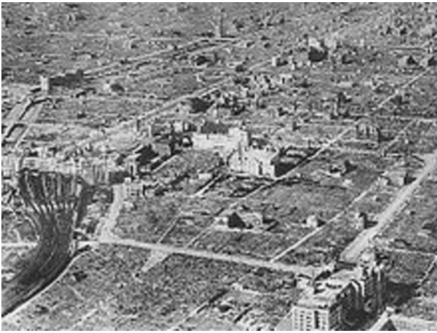
Aftermath of Osaka firebombing

famous as a symbol of resilience and hope amidst the devastation: Three men, their homes destroyed by fire and with only the clothes on their backs, gathered in the burnt-out ruins of Taishō Ward with a sanshin (Okinawan shamisen ) they had managed to salvage from the ashes. As they began to play and sing the best-known Okinawan folk song “Asato-ya yunta” (Ballad of the Asato Family), others gathered to listen or join the singing. At that moment, it is said, postwar recovery began for Okinawans in Osaka. 140