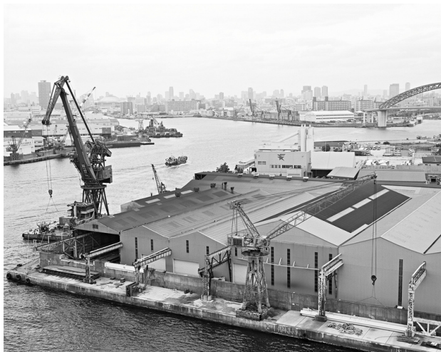
Factories in Taishō Ward, Osaka