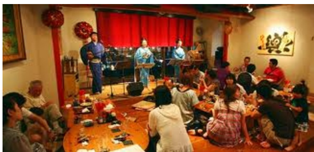
Okinawan folk music performance at Osaka restaurant

1940 into the Amagasaki League of Okinawa Prefectural Associations, which consolidated after the war to become the present Hyōgo Okinawa Association, with a membership of approximately 5,000, according to a recent survey. 10 During and after the war, it provided counseling free of charge to Okinawans seeking employment, negotiating with employers, applying for government permits or benefits, starting businesses, or trying to earn a living after their family breadwinner had died in the war. 11