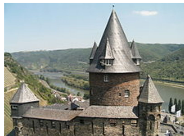
Fig. 6 - Stahleck Castle

Setting aside the question of Communism's ideology, the people at its core are intellectuals who have never been intimately connected with the land. Furthermore, their ideology is something that has been directly imported from abroad and has no roots in the history of that country. Taking their claims to be absolute, they butcher those who oppose them without hesitation. This is something that others and I can in no way approve. While it is true that Nazis and Fascists also insist on totalitarianism, in one sense it can be said that theirs is a form of resistance to Communist actions. Or it can also be understood as turning the Communists' methods to their own advantage.