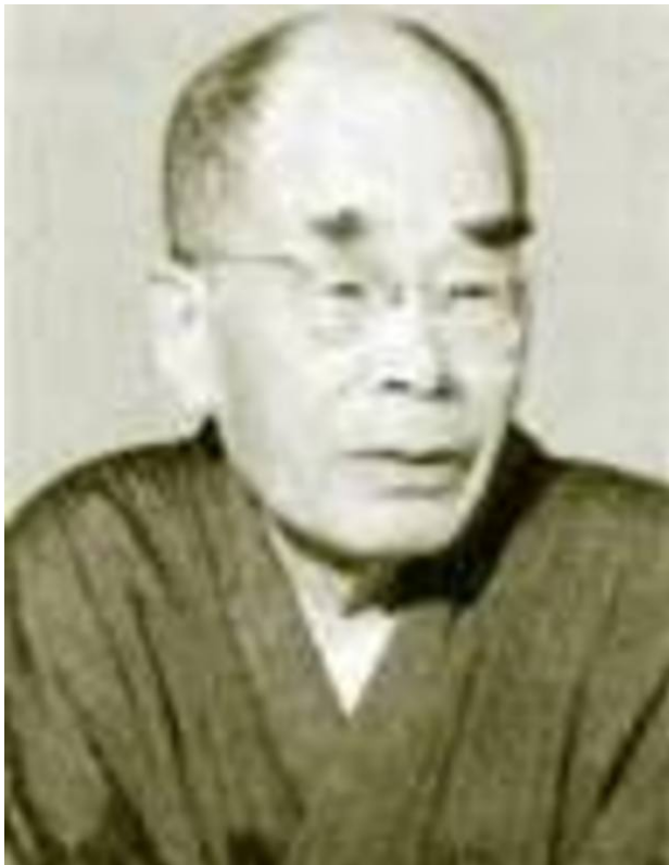
Fig. 1 - D.T. Suzuki

The always contentious, sometimes highly emotional, debate over D.T. Suzuki's relationship to Japanese fascism continues unabated. Among other things this is shown by reader reactions to a recent article in Japan Focus entitled " Zen as a Cult of Death in the Wartime Writings of D.T. Suzuki ". This debate can only intensify by the further assertion of a wartime relationship between D.T. Suzuki and the Nazis or, more precisely, a positive or sympathetic relationship between Suzuki and the Nazis. This article, in two parts, will explore that possibility though conclusive proof of such a relationship will not be included until the second part.