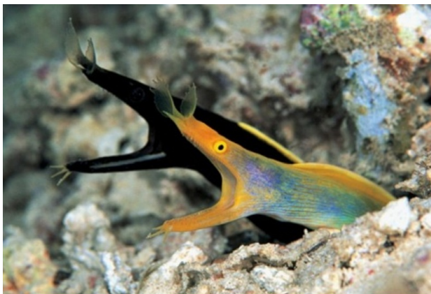
Leptocephali eel larvae captured on film off Indonesia. One of 800 varieties of eel, only a few of which are eaten.

Japan is the world's top consumer of eels, but while most of what's grilled, glazed with sweet-salty sauce, and served up on rice here comes from fish farms, none of those farms hatch their eels from eggs. Instead, they rely on wild young caught in rivers and coastal waters worldwide known as two-inch-long "glass eels." Until very recently scientists knew little about the life of the animal in the open ocean, where sexual maturation and spawning take place.