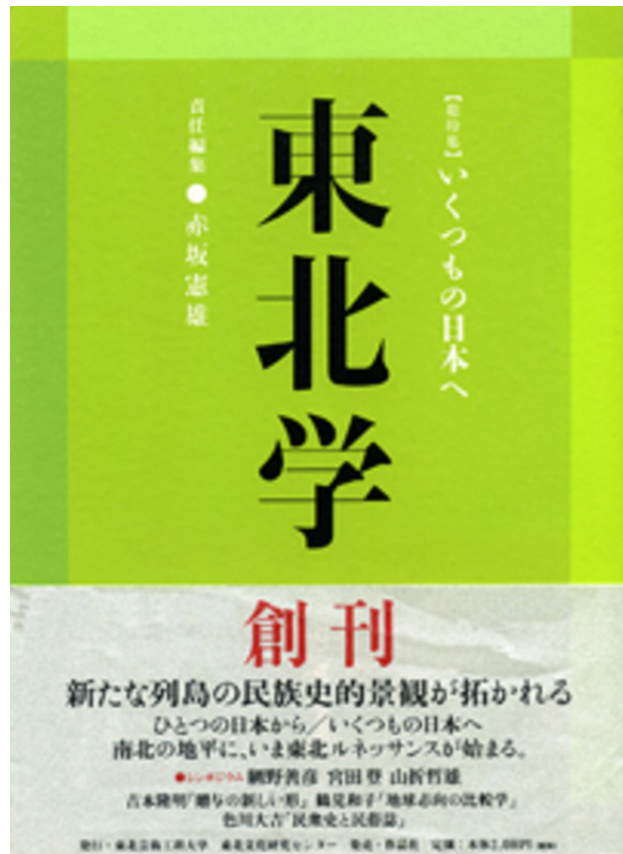
Fig. 4: The inaugural issue of Tōhokugaku (1999)

Another important voice to join in this criticism is that of Akasaka Norio, a folklorist, critic, and highly visible public intellectual often credited as the father of "Tōhoku-ology" ( Tōhokugaku ). Akasaka had been the first director of the Tōhoku Culture Research Center (TCRC) at Yamagata's Tōhoku University of Art