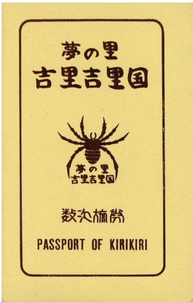
Fig. 6: "Passport" to the fictional country of Kirikiri, setting of Inoue Hisashi's Kirikirijin

real socioeconomic renaissance to come. 34 But in the meantime the rhetoric of "reconstruction" drags irresponsibly on, as does the shameful reality that even reconstruction is barely proceeding and the national government remains uncommitted. 35