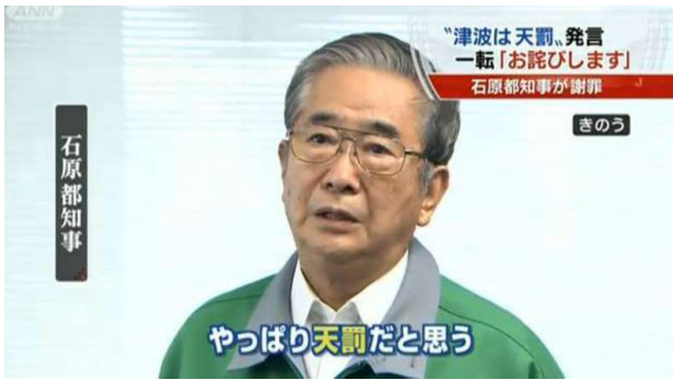
Fig. 2: Ishihara Shintarō retracting his remark that the 3/11 tsunami was “divine retribution”

1960s, Japan was home to a “well-off majority” increasingly willing to pursue economic growth and to stay out of politics. In exchange for depoliticizing society, middle-class Japanese were promised economic wealth and fast, stable growth. By the end of the millennium, the disintegration of the “bubble economy” and Japan’s persistent failure to rekindle economic growth had eroded confidence in this model. In the previous three decades, the strength of the post-1970 social contract that historian Oguma Eiji calls the “1970 paradigm,” was based on the existence of a stable, well-off middle-class. 4 The oft-cited polls indicating that nine of ten Japanese considered themselves “middle-class” during subsequent decades are evidence of, and a key condition for, the paradigm’s success. 5 The paradigm was fraught and questioned from the outset. After all, it was in the 1970s that problems of environmental pollution and degradation, gender, minorities—ethnic Koreans and Chinese, mostly—living in Japan and essentially indistinct from “Japanese,” and other issues of majority-minority power imbalances and discrimination were also brought to the forefront, not infrequently by the victims themselves. Nevertheless, overall, nonpolitical stances ( nonpon ) dominated—not least because they were amply rewarded economically.