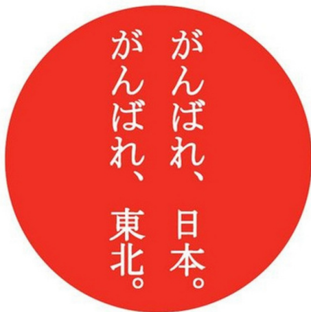
Fig. 5: This emblem, pairing "Ganbare Nippon!" ("Go Japan!") with "Ganbare Tōhoku!" is emblematic of the tendency to see 3/11 and its aftermath in national terms.

Akasaka is probably only partially correct. After Ishihara Shintarō's "divine retribution" remark, scholar-critic Tanaka Yūko fired off an angry riposte. Tanaka wrote, "Watching panicked children search for lost parents or husbands for their wives, there cannot be many people in the world who would use the meaningless adjective 'Japanese' to describe them. Their name is not 'Japanese'... Never has the word 'Japan' been more meaningless." 28 She was wrong, of course: domestically, at least, the Japaneseness of victims has been emphasized more than their universal humanity, repeated ad infinitum and made a fundamental rationale for aiding them—as fellow Japanese and as fellow members of an economy shaken by disaster and threatened by failure to get quickly back on track. Calls of "Ganbare Nippon!" ("Go Japan!") were paired with "Ganbare Tōhoku!" as the "Japaneseness" of the tragedy was forefronted.